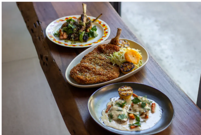
Dishes at Eva restaurant in Coconut Grove.